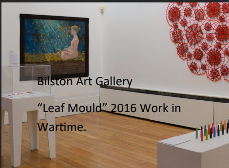
Bilston Art Gallery