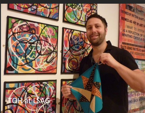
TOH at LSAG