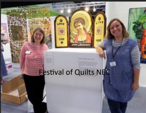
Festival of Quilts NEC