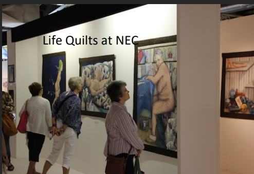
Life Quilts at NEC